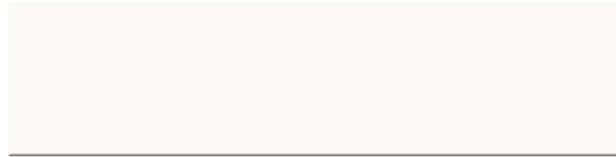
EAS WHT73G ▶ 75 X 300mm ▶ glossy